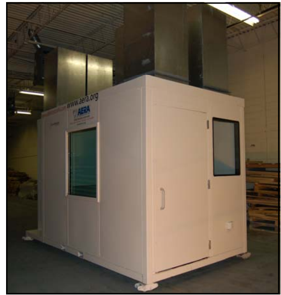
Up to 12' wide x 40' long x 10' high